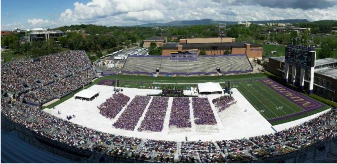
The 2017 JMU commencement ceremony at Bridgeforth Stadium