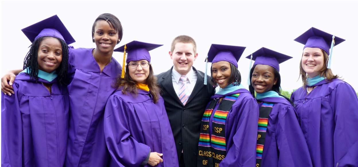
Program graduates on graduation day