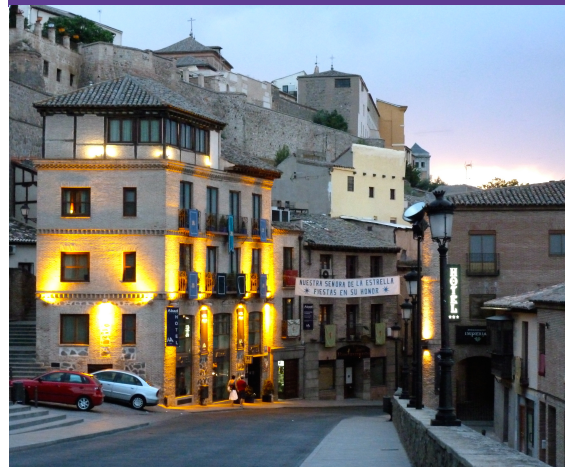
Toledo, Spain at dusk from 2012 Study Abroad trip

The AHRD Master's program gives program graduates a competitive edge when they enter the workplace. Our program provides both the theoretical grounding and practical experience necessary to design, develop, implement, and evaluate innovative and effective technology infused learning programs. Our core curriculum ensures that students are prepared to work in the field, and our summer study abroad program builds skills in global competence and visual communication, both critical competencies in today's job market.