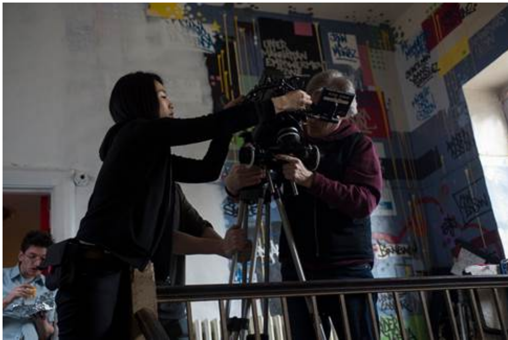
Crewmembers during the filming of Eggs and Soldiers