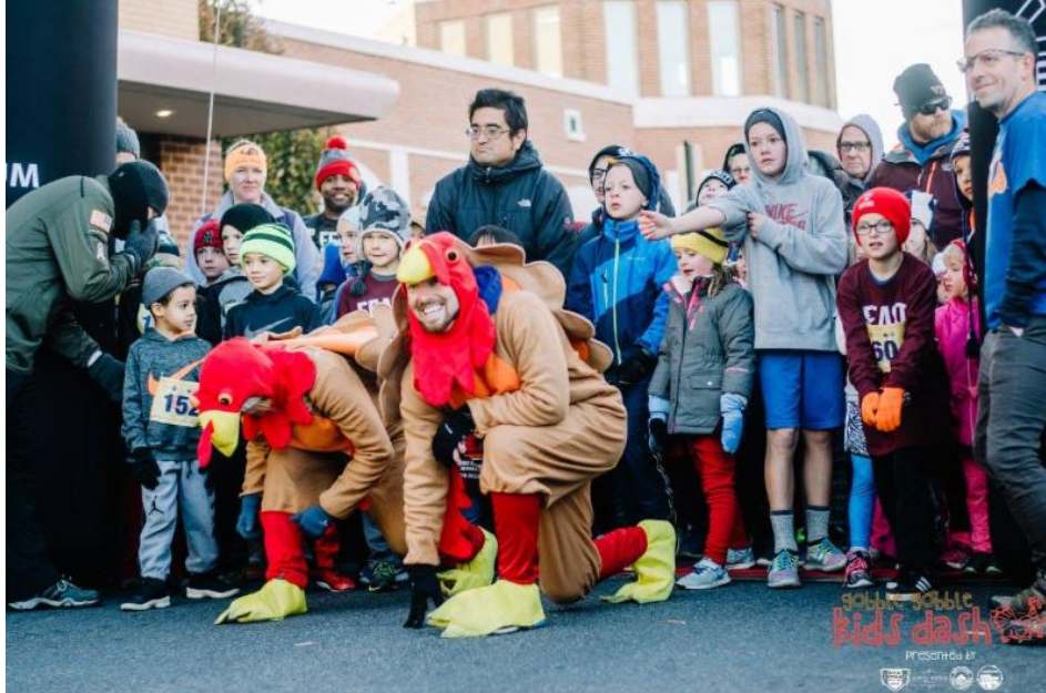
Runners at the ready for the Gobble, Gobble Kids Dash at the 2017 Turkey Trot.