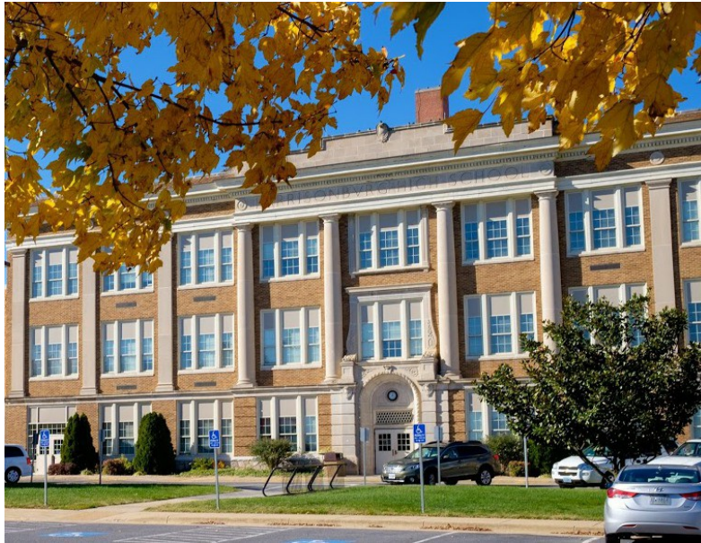
Memorial Hall, formerly Harrisonburg High School, houses the JMU College of Education.