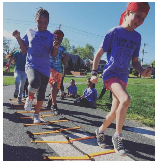
Girls participating in the Morrison Bruce Center's Girls Have H.E.A.R.T. program outside of Waterman Elementary.