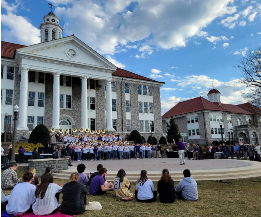
JMU's Gathering of Hope on February 11.