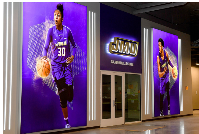
Left to Right: Atlantic Union Bank Center entrance, court-side seating, arena overview, and student athlete highlight outside the Campanelli Club.