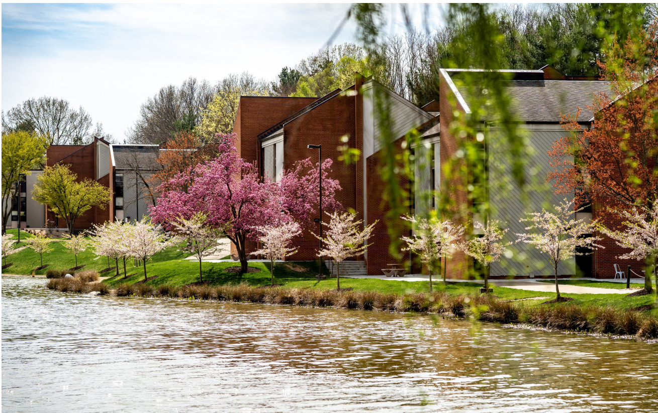
Greek Row, located by Newman Lake near Bridgeforth Stadium, is home to on-campus living for numerous Greek Life organizations

We invite you and your students to follow us on Instagram @JMUadmissions , too. If you have not already, please consider joining our counselor mailing list to stay up to date on all things JMU!