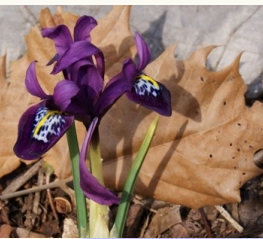
Dwarf Iris Cultivars Iris species

Native to western Europe. The leaf spots are air pockets that cool the plant. The pink flowers turn blue as they mature to attract pollinators.