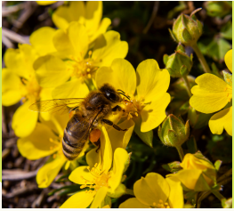
Winter Aconite Eranthis hyemalis

Spring is the time when there's warmth, moisture, and sunlight on the forest floor. A spring ephemeral is a plant that completes its entire life cycle in the spring, sending up flowers and setting seeds before dying back to the ground. The plant remains dormant, roots resting underground, until the following spring.