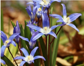
Glory of the Snow Chinodoxa luciliae

Native to the Mediterranean Any daffodil is a narcissus, but not all narcissi are daffodils. The number of flowers on the stem and the trumpet length make the difference.