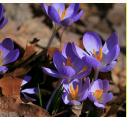
Spring Crocus, Snow Crocus Crocus vernus & chrysanthus

Native to eastern North America. The roots are tubers; it was also called "fairy spuds" or wild potato.