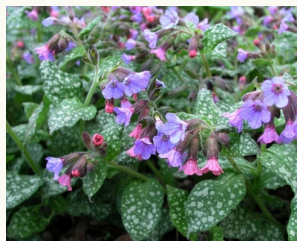
Lungwort Pulmonaria saccharata

Native to the Mediterranean. Under the bloom is a corm, a thickened stalk that stores energy. Crocuses make seeds, but also reproduce through making new little corms.