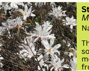
Star Magnolia Magnolia stellata

Native to China and Myanmar. Find it near Journey Stage Garden. Bark is used to make traditional Japanese paper (washi).