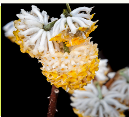
Paperbush Edgeworthia chrysantha 'gold finch'

Native to China and Myanmar. Find it near Journey Stage Garden. Bark is used to make traditional Japanese paper (washi).