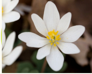
Bloodroot Sanguinaria canadensis

Native to Europe & Asia Minor. Important early nectar source for bees. They are planted by bulbs.