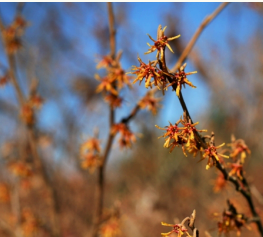
Witch Hazel Hamamelis x intermedia 'Jelena'

Native to Japan. This tree and its beautiful blooms are somewhat fragile. The early bloom time means these flowers are often damaged by frost.