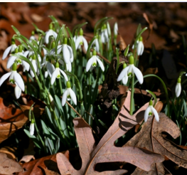
Snowdrop Galanthus nivalis

Native to eastern North America. In the poppy family. Broken leaves, stems, or roots give off a toxic orange latex as if bleeding.