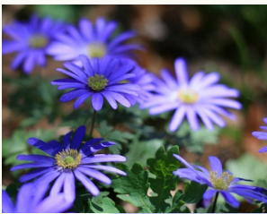
Grecian Windflower Anemone blanda

Most are native to Europe and Asia. In Greek mythology, Iris was a messenger of the gods. The French fleur-de-lis is related to the iris.