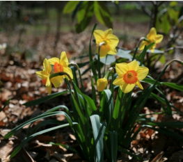
Daffodils Narcissus species

Native to southeast Europe and Asia Minor. In the buttercup family. Grows from corms and requires well-drained soil.