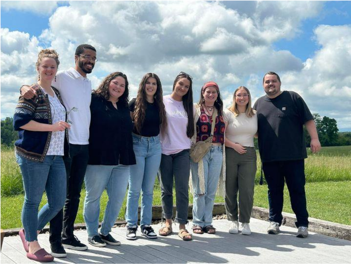
James Madison University School Counseling “Class of 2024”