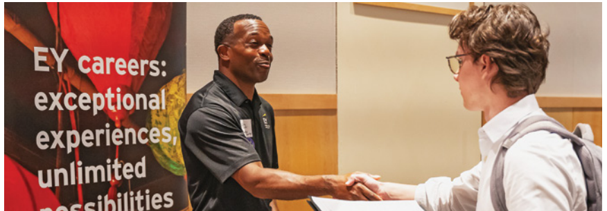
Students make valuable connections at the “Meet the Firms” annual career fair.

See the JMU graduate course catalog for details.