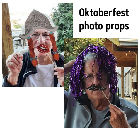
Oktoberfest photo props