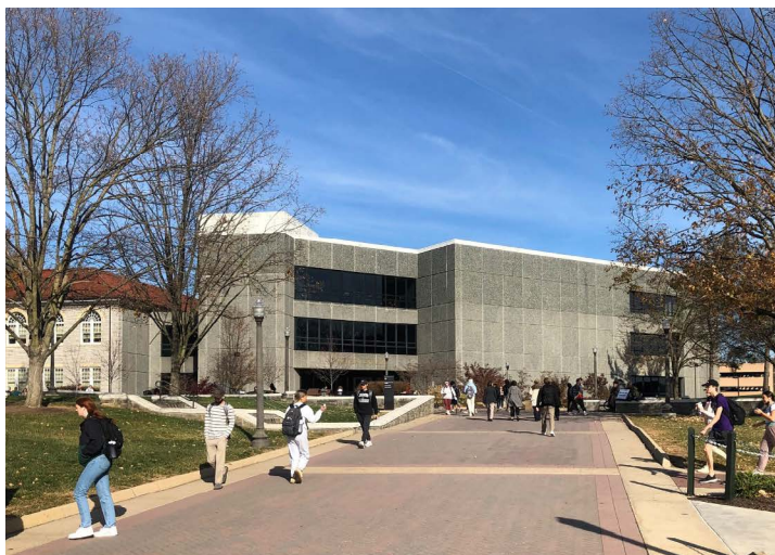
Previous East View