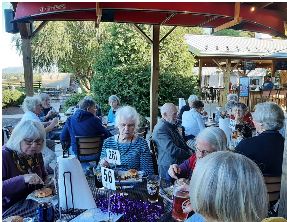
Beer Group during Oktoberfest at Stable Craft Brewing

jmu.edu/emeriti/membership/interest-groups.shtml