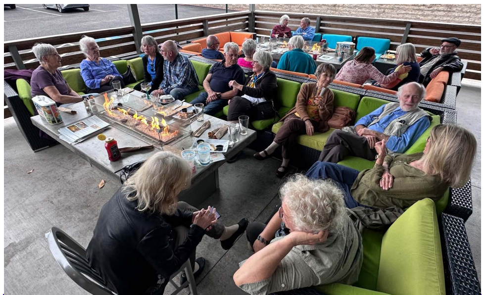
The Beer Group at Island Wing in May