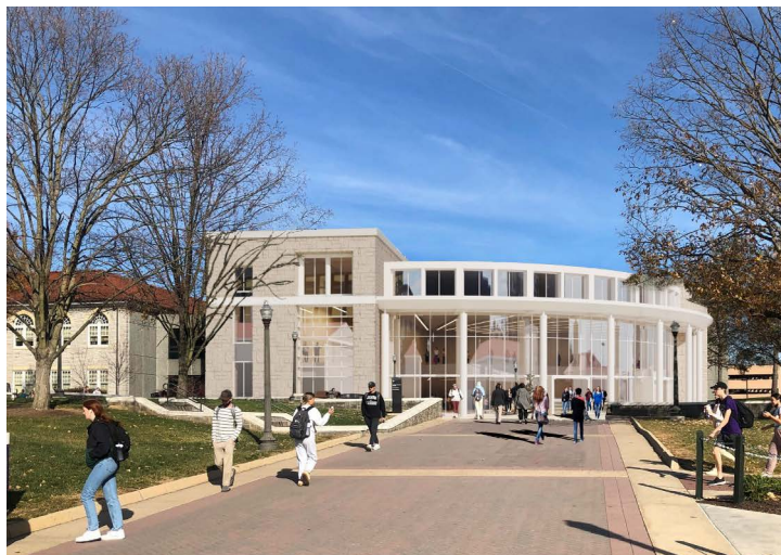
Future East View