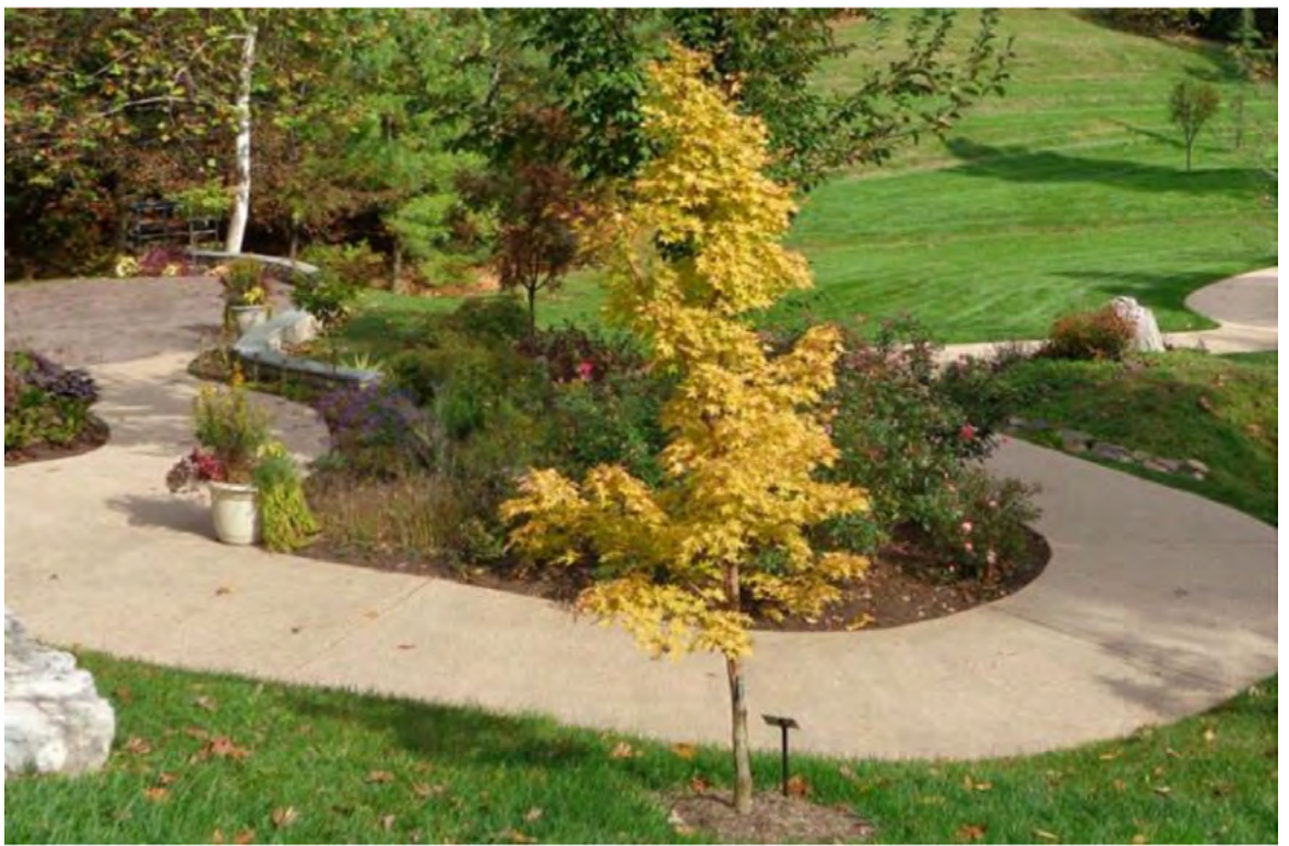
Grounds (biodiversity and landscape management) was among the categories JMU received high scores. An example of this is the Edith J. Carrier Arboretum pictured above.

The rating is based on a framework — the Sustainability Tracking, Assessment & Rating System — for colleges and universities to measure their sustainability performance. The framework addresses the environmental, social and economic dimensions of sustainability. JMU submitted its latest report in December. The university also submitted reports in 2013 and 2017, and received silver ratings.