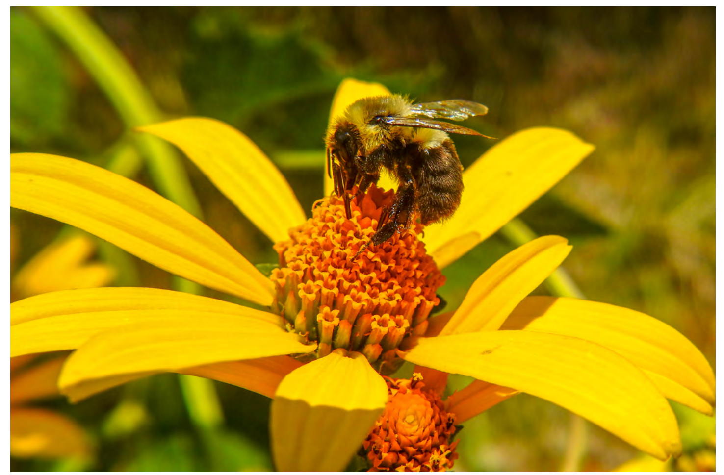
APPA 2018 SUSTAINABILITY INNOVATION AWARD

JMU also received one of APPA's 2018 Sustainability Innovation Awards. The Sustainability Innovation Award criteria measure the current level and effort of a facilities management department to integrate sustainable policies and environmental practices throughout all facets of the organization, ultimately embedding them within the educational institution. JMU has become a model program in the Chesapeake Bay region by forging partnerships with a wide range of local and state agencies; engaging students, faculty, and staff to build awareness and contribute solutions; utilizing innovative techniques and methods to maximize improvements in stormwater management and water quality; and leveraging grant funding to minimize the budgetary impact to JMU of new regulations. APPA, previously known as the Association of Physical Plant Administrators, promotes leadership in educational facilities for professionals seeking to build their careers, transform their institutions, and elevate the value and recognition of facilities in education.