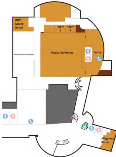
Festival Upper Level