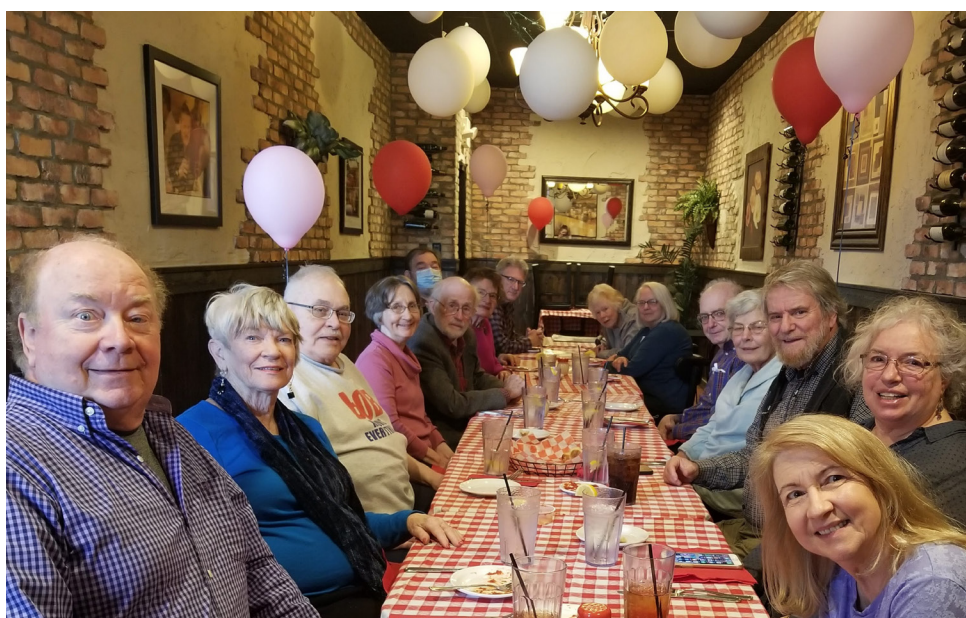
Members enjoy each other's company at Vito's in February 2022.

jmu.edu/emeriti/membership/interest-groups.shtml