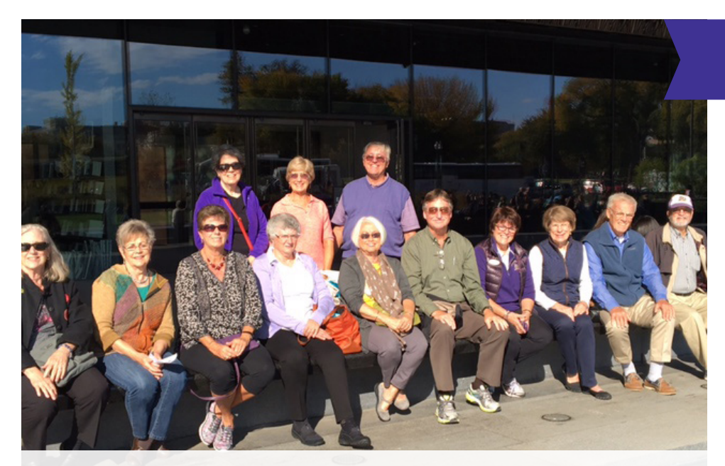
Trip to the Smithsonian National Museum of African American History & Culture in Washington, D.C. | October 2017