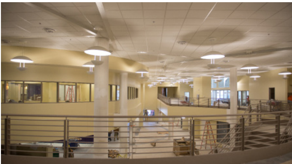
Interior of the Student Success Center