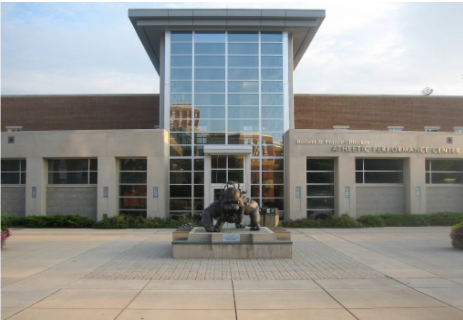
The APC, home to many resources for athletes including UWC tutoring