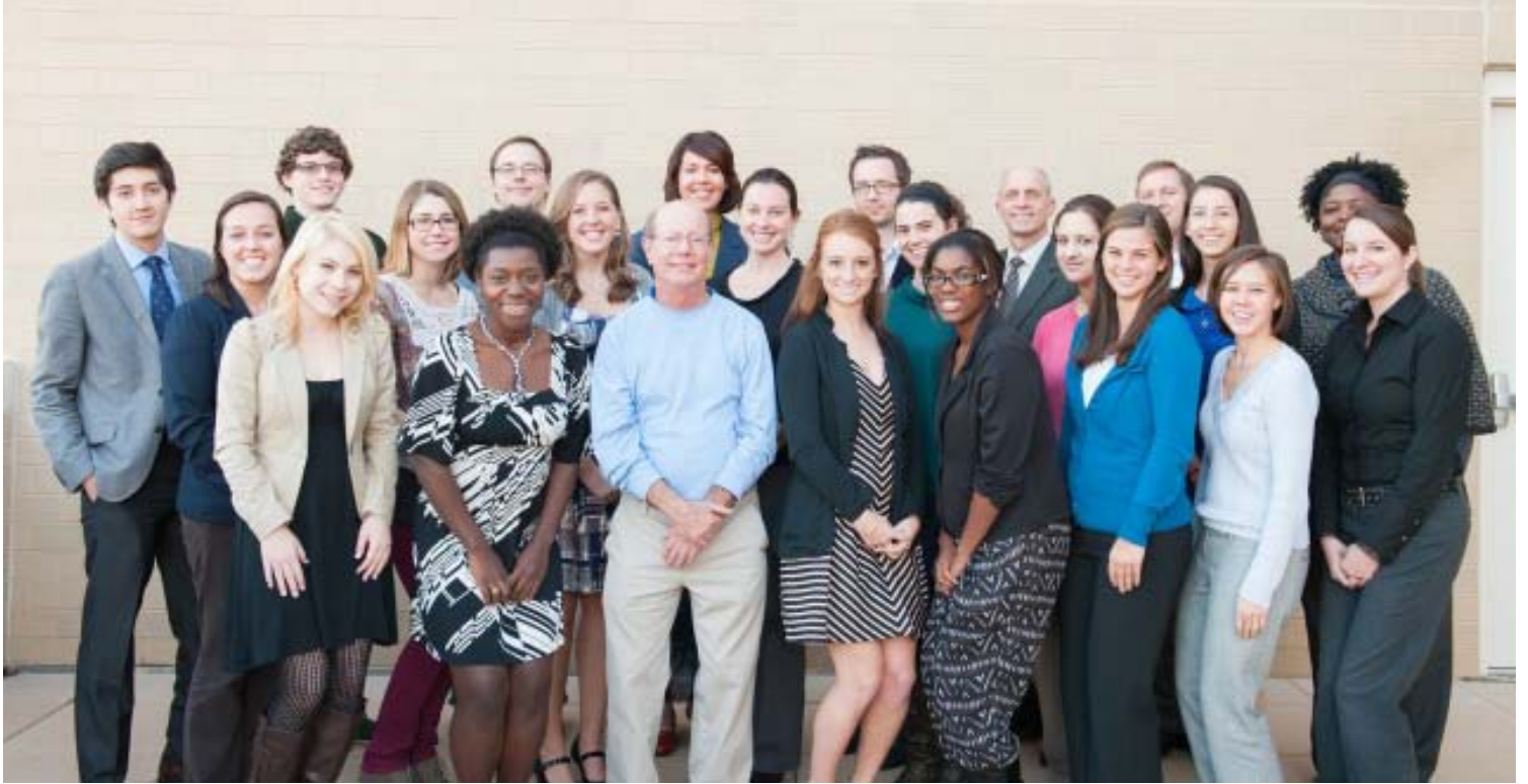
Learning Centers tutors and JMU faculty and administrators at the inaugural Tutor Excellence Recognition Celebration this fall