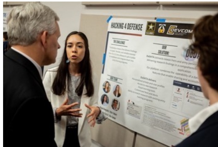
“Hacking for Defense” ENGR 498 / POSC 361