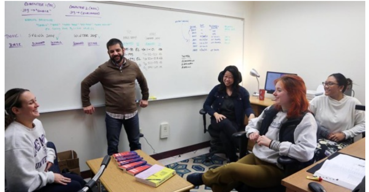
American Political Reform and Innovation Laboratory (APRILab)