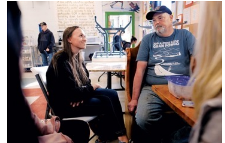
“Community Innovations” IPE 490 / PPA 483 / WRTC 328