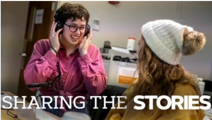
“Harrisonburg 360 Podcast” ENG 360