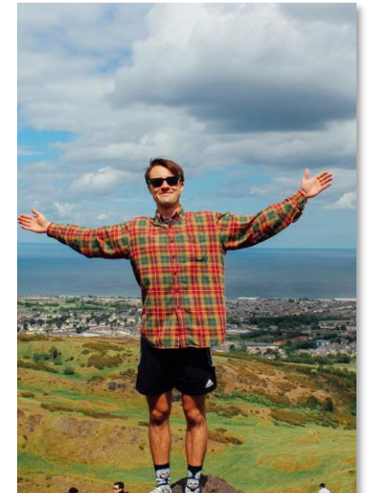
Edinburgh, St. Andrews, Scotland