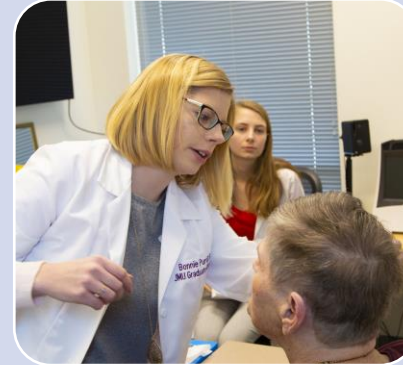
Clinical & Field Placements