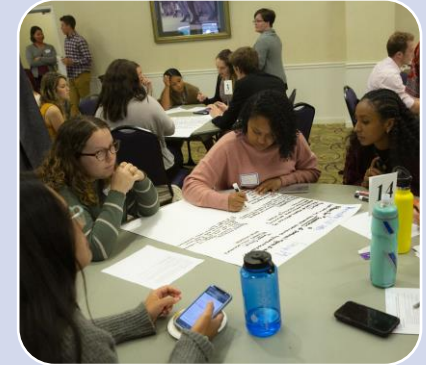
Inter- disciplinary & Inter- Professional Education & Practice